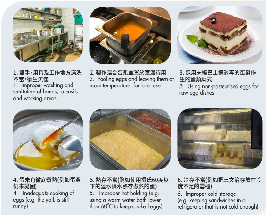
圖1: 食物業處所常見用以烹製蛋類菜式的高風險做法 Figure 1: Common high-risk egg preparation practices in food premises.

混合蛋漿是指把若干隻蛋打開後置於容器中混合而成的蛋漿，用於製作多客蛋類菜式，或用於多種食物配方。製作混合蛋漿是一些食肆常見用以節省時間和控制分量的做法。然而，若有一隻或以上的蛋受感染，把蛋混合便會使容器中全部蛋漿都受到污染，以這些混合蛋漿烹製的蛋類菜式如未有徹底煮熟，可能會導致食用後出現食物中毒。受污染的混合蛋漿亦可成為食肆中沙門氏菌的來源，污染用具或其他食物。