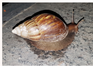
圖1:本地野生蝸牛示例 Figure 1: An example of a local wild snail

A recent discussion on whether local wild-caught snails can be consumed directly stirred up some controversy online. Snails are omnivorous animals. Edible snails (escargots) are raised in farms with strict control of living environment and feeds. In contrast, there is no control of what wild-caught snails have eaten, they may be contaminated with toxic substances and have a higher risk of being infected with parasites. Cases of Angiostrongylus cantonensis infection after eating wild-caught snails have been reported overseas. The parasite can invade the central nervous system in humans and cause meningitis, which can be lethal.